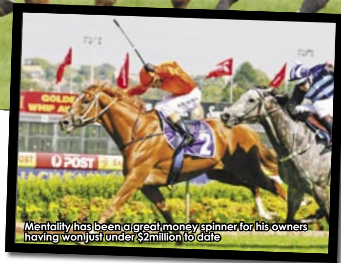
Mentality has been a great money spinner for his owners having won just under $2million to date

who has recorded two Black Type wins this season. She won the Gr 3-Research Stakes at Rosehill Gardens on 13th September and the Gr 3-Bill Ritchie Handicap at Royal Randwick on 27 September. Judged has faced the starter 18 times for five wins and six second placings.