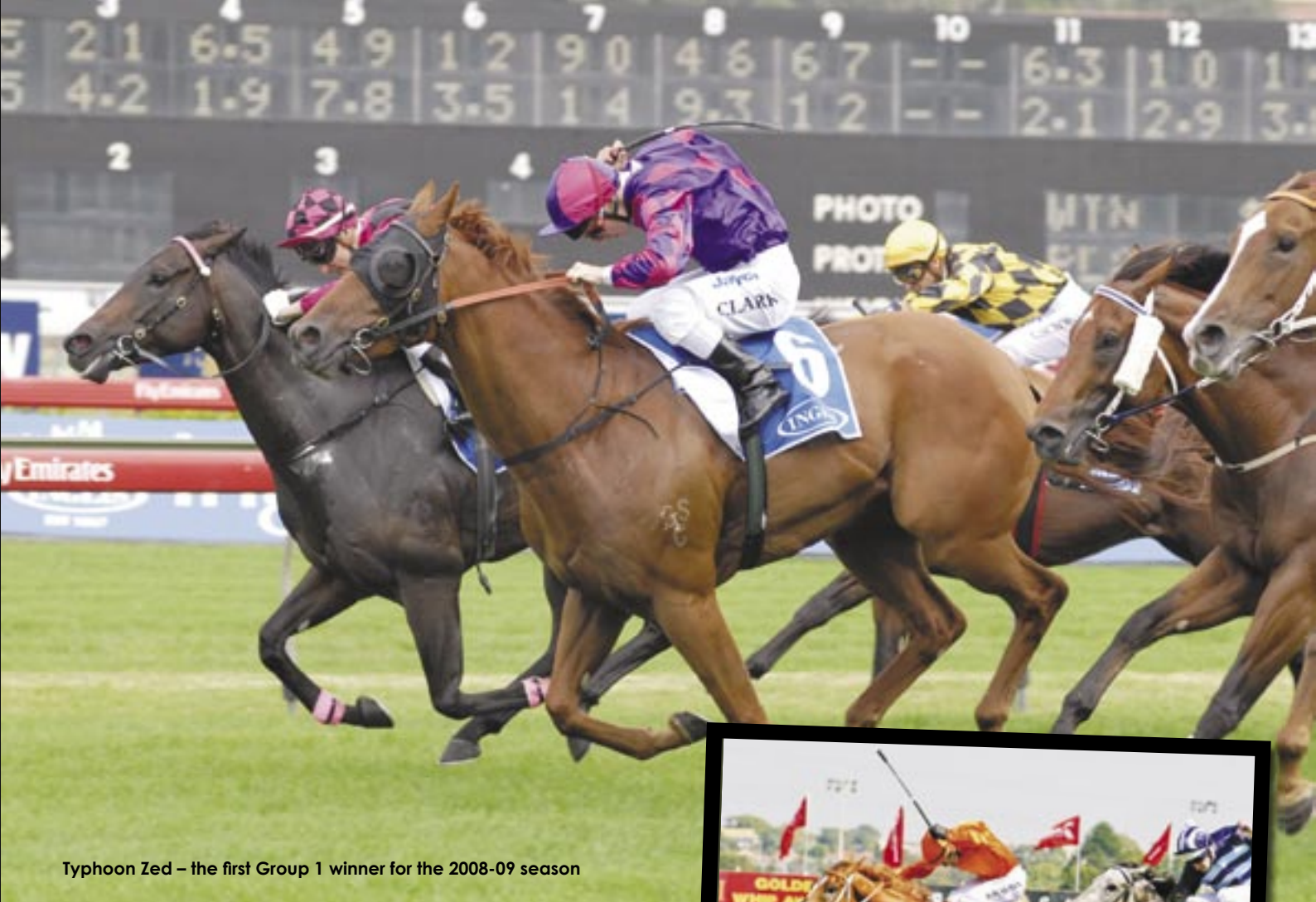
Typhoon Zed – the first Group 1 winner for the 2008-09 season

Racing to Win, the NSW Sprinter/Miler of the Year for 2007-2008, was successful in the Gr 2-Warwick Stakes at Warwick Farm on 23rd August.