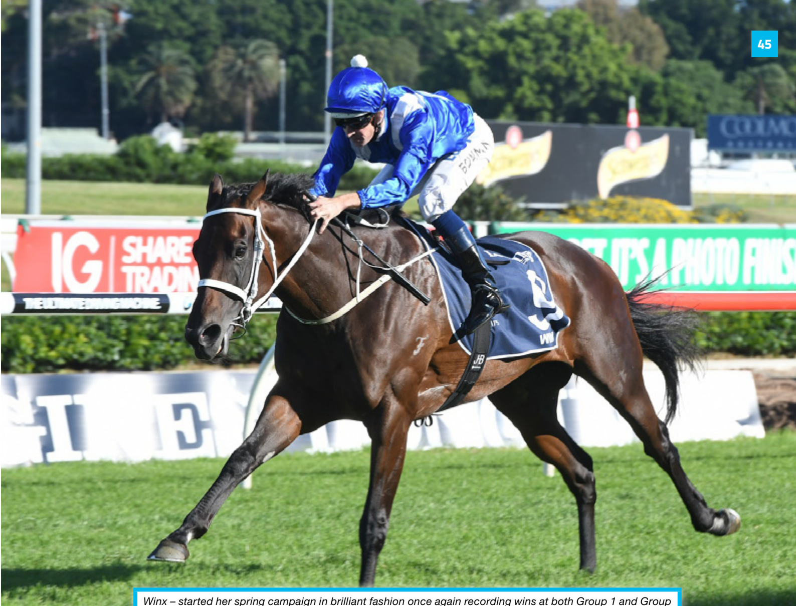
Winx – started her spring campaign in brilliant fashion once again recording wins at both Group 1 and Group 2 level.