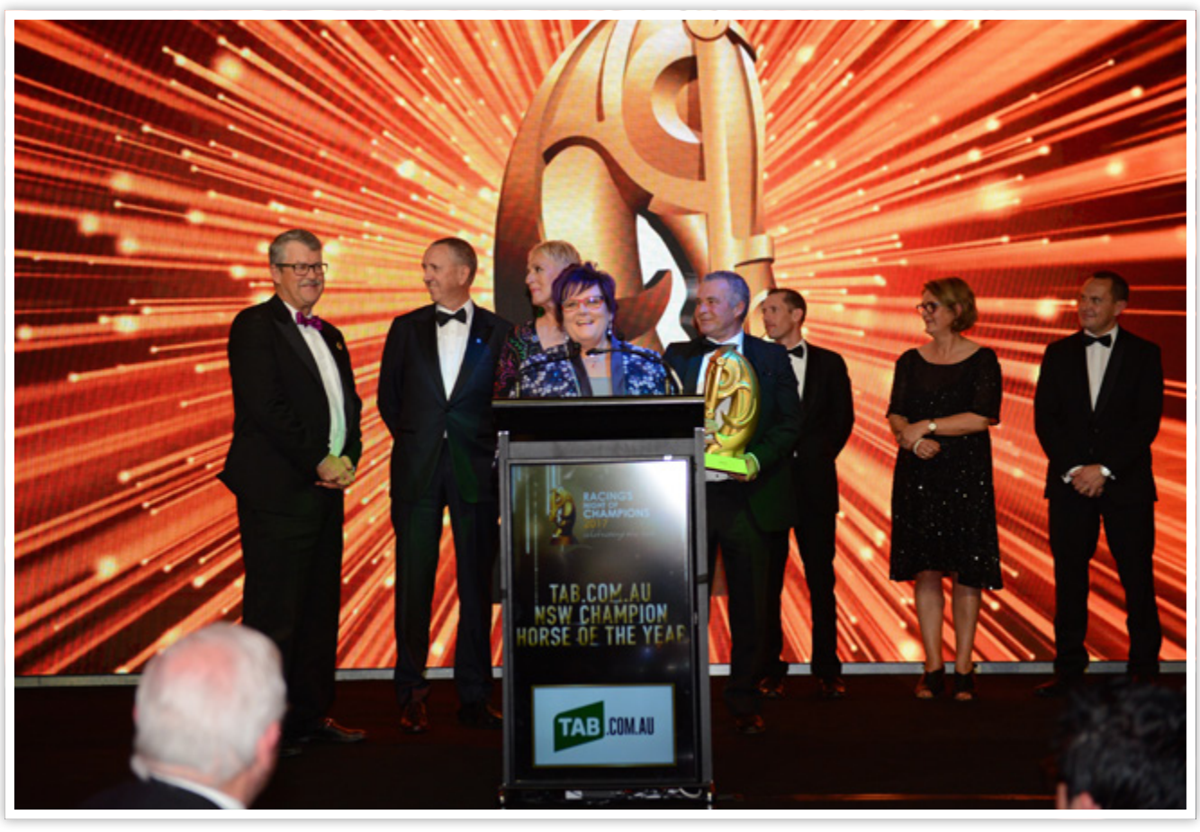
Connections of Winx accept the 2017 TAB.com.au NSW Champion Horse of the Yea

For more information regarding the 2018 Racing's Night of Champions, contact the NSWROA office via telephone (02) 9299-4299, by email nswroa1@ozemail.com.au or visit the NSWROA website www.nswroa.com.