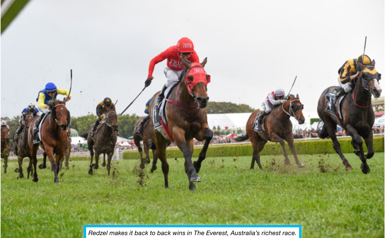
Redzel makes it back to back wins in The Everest, Australia's richest race.