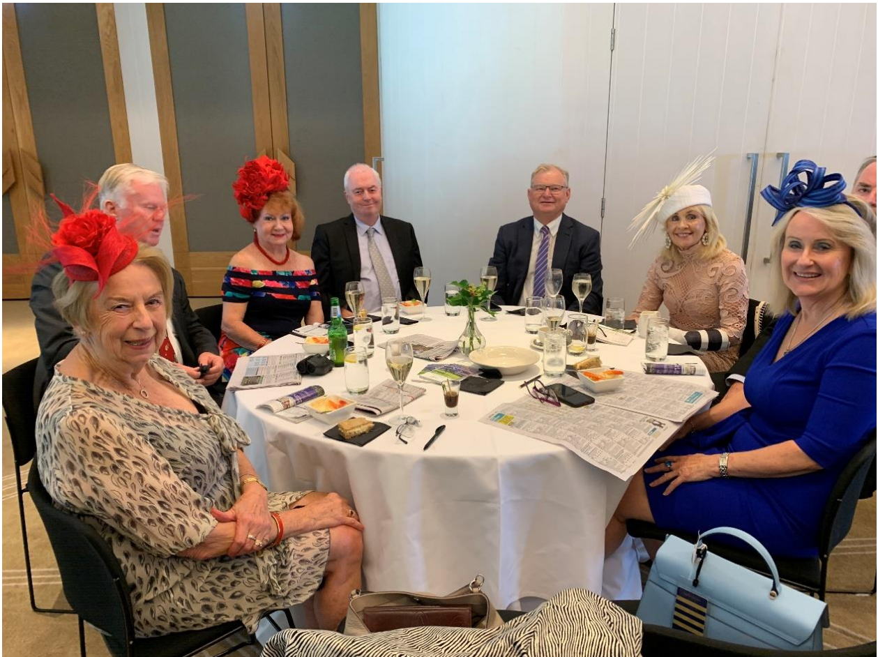
Some of our lovely guests on Chinese Festival of Racing Day