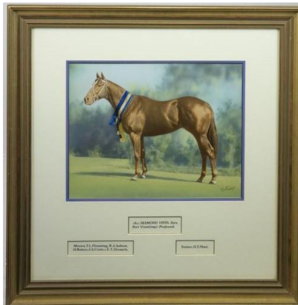
(left) De La Salle – charismatic mare and winner among many other races of the 1948 Epsom Handicap. (right) Diamond Vista – a quality 2YO and later high class sprinter.