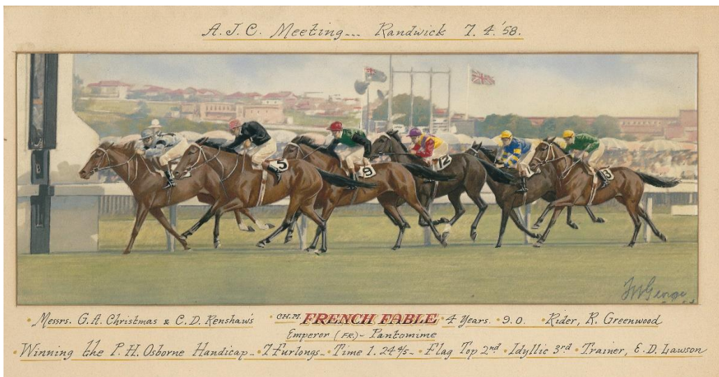
The finish of the P H Osborne Handicap 1958 won by the good mare French Fable .