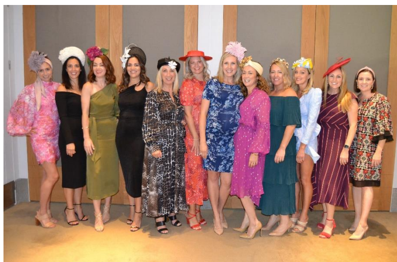
Models from The Shared Atelier