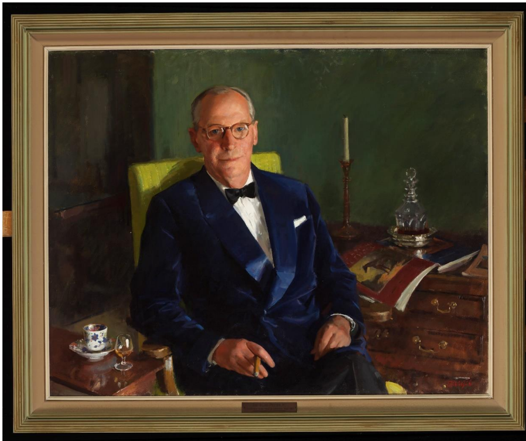
Sir Alan Potter