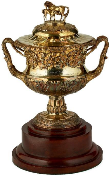
1960 Brisbane Cup

Valerius began racing in 1958 and his career came toward the end of the era for breeding stayers in Australia. The sprinter was soon to become dominant on our shores when Newtown Wonder, then Star Kingdom then Wilkes led the paradigm shift to breeding early-coming speed racehorses. His dam produced four Group 1 winners – Valerius – his brothers Caesar (AJC Queen Elizabeth Stakes) and Prince Delville (AJC Derby) and his sister Redeswood (Flight Stakes). As well she produced Fort William (Ascot Handicap) and Roman Holiday (Eclipse Stakes), both also brothers to Valerius.