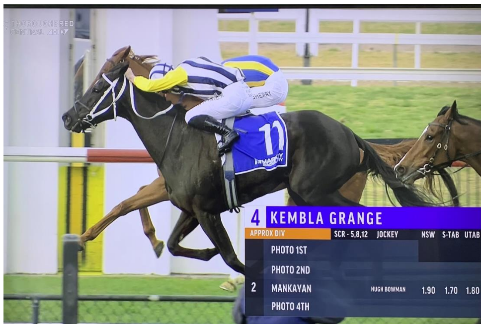
Our Intrigue (NZ) – outside - nosing out Off Shaw (NZ)

The NSWROA Trophy Handicap, a race named for our Association by the ATC, was conducted on 18 August on Owner Celebration Day at Kembla.