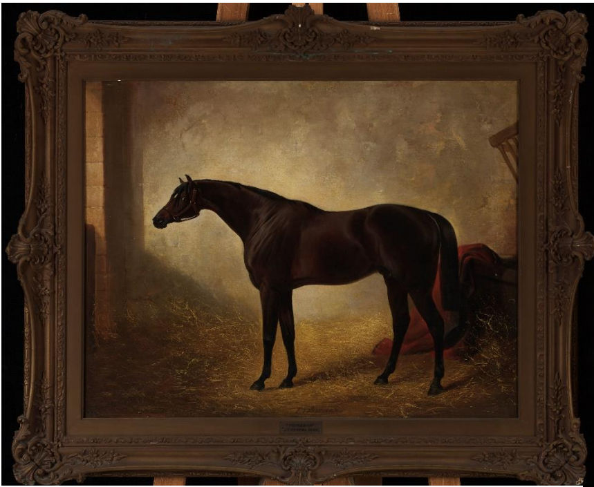
Artist J F Herring

(NSWROA member and volunteer at the ATC Heritage Centre)