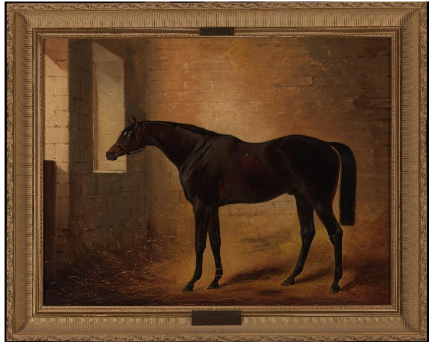
Artist Henry Barraud

Among his outstanding progeny in the four full crops he produced were Angler (Victoria Derby, VRC St Leger), Fishhook (AJC Champagne Stakes, St Leger, Sydney Cup, VRC St Leger), Seagull (VRC Ascot Vale Stakes, Victoria Derby, VRC Oaks), Cowra (Adelaide Cup. Twice.), Lady Heron (VRC Ascot Vale Stakes and VRC Oaks), Sylvia (VRC Oaks and later a great broodmare), Sour Grapes (VRC Ascot Vale Stakes), Fenella (VRC Ascot Vale Stakes, All-Aged Stakes and the AJC Champagne Stakes), Gasworks (VRC St Leger, Australian Cup and Town Plate) and My Dream (Victoria Derby, VRC Oaks heroine of 1868/69).